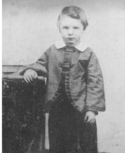
William Wallace "Willie" Lincoln.