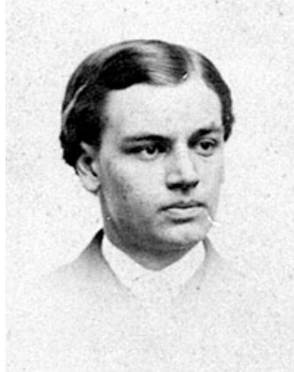
Robert Todd Lincoln. Mr. Lincoln's White House . 18 July 2008. , http://www.mrlincolnswhitehouse.org/inside.asp?ID=16&subjectID=2 >