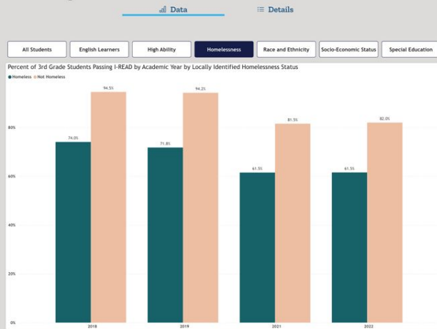
State of Indiana: 3rd Grade Literacy